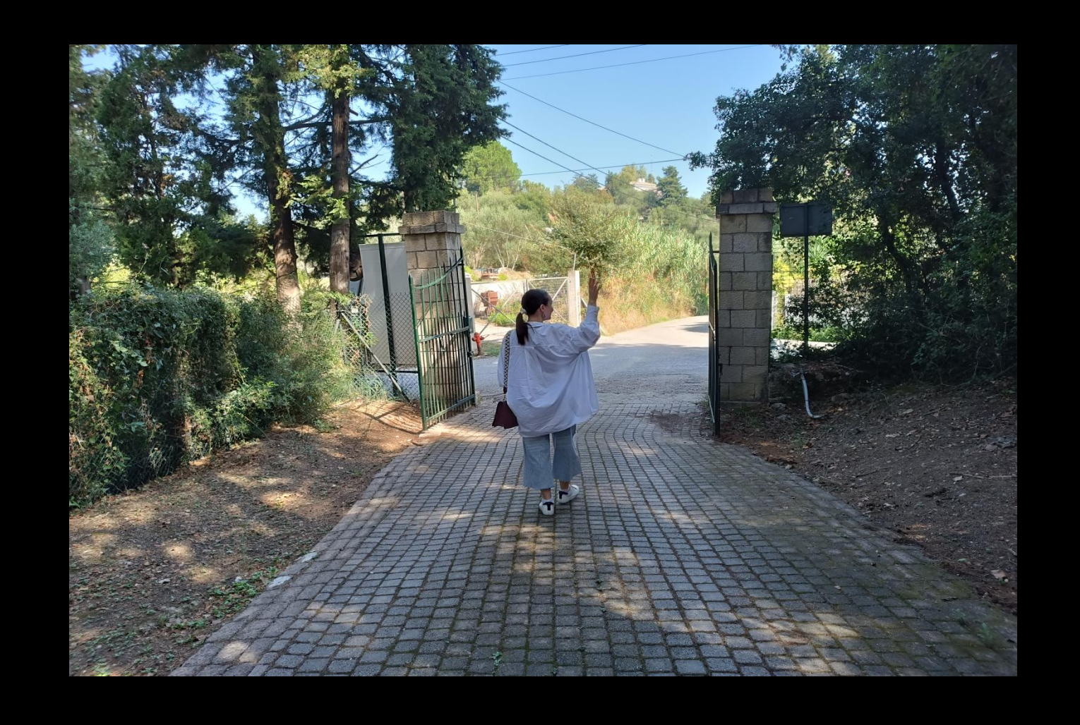
Goodbye Capodistrias Museum! I hope to visit you again and learn more about Ioannis Capodistrias!